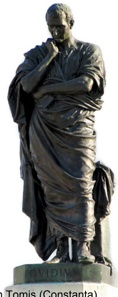
Ovid in Tomis (Constanta)